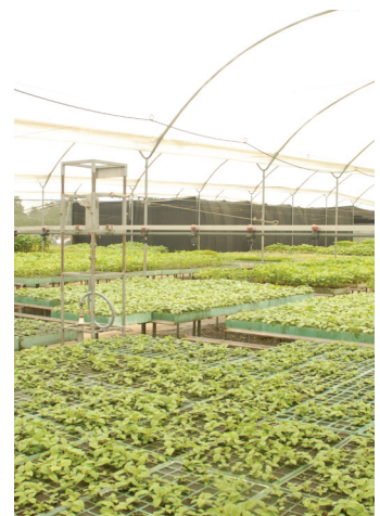
Fig. 1: 3A Composites AIREXBALTEKBANOVA Ecuador balsa nursery overview.