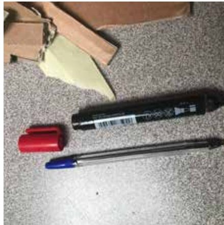
pen and marker