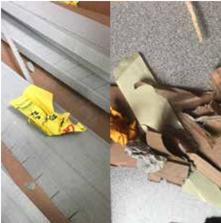
paper and cardboard