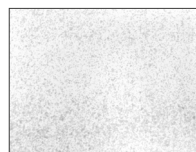
COVERAGE TOO LIGHT