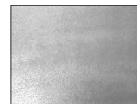
COVERAGE TOO HEAVY