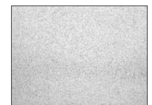
CORRECT APPLICATION = 5 - 15 grams/m 2